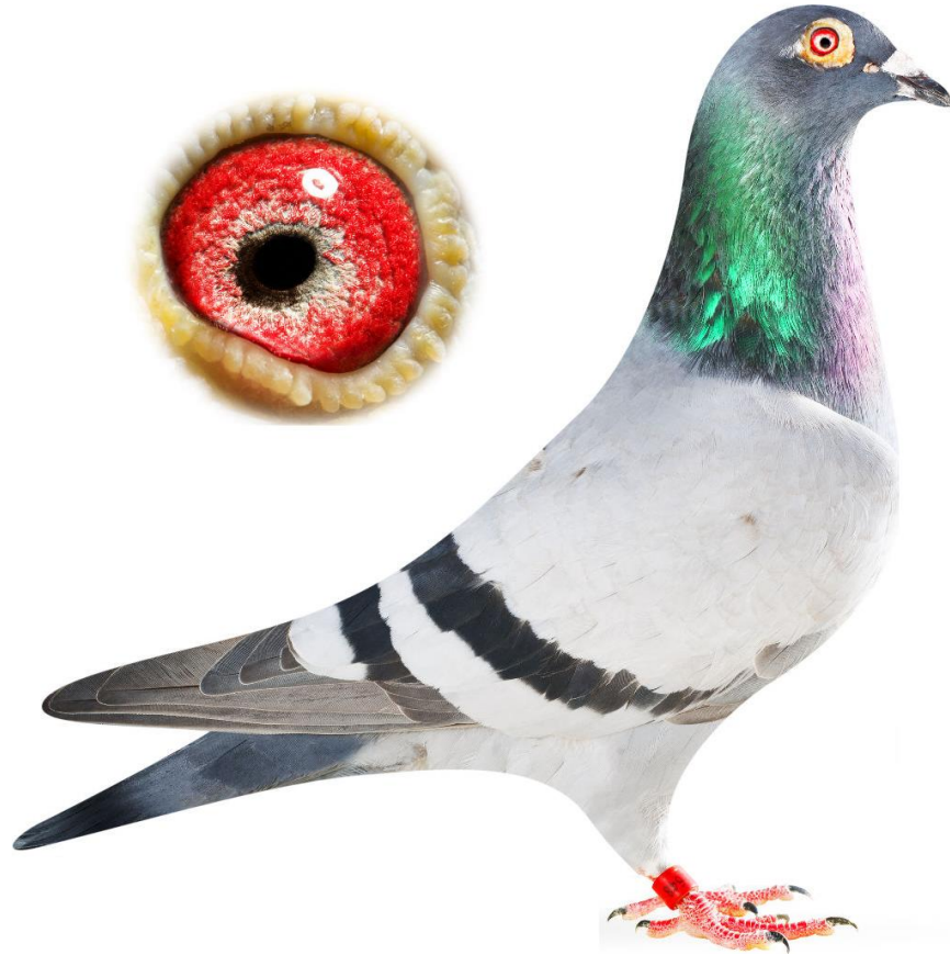
BE17-5071648 JELSON'S 648